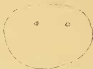
Fig. 5. Primitia bipunctata .

Mr. J. W. Salter, F.G.S., long ago supplied one of us with specimens of black Llandeilo Flagstone (from Hellpool, Wye-forth, near Builth, in South Wales), bearing numerous impressions and casts of minute subquadrate Entomostracan valves, each having two little pits near the straight edge. The features are obscure, and the specific characters necessarily indefinite; but we wish to place this little Lower-Silurian form on record, with a figure, among its allies.